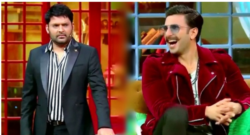
absence from television. Also, Kapil and Kiku's funny banter takes you

Mumbai : The wait is finally over. Kapil Sharma's show The Kapil Sharma Show goes on air from December 29, 2018. This time, the comedian seems to be in his elements and has come all prepped up to make the audience laugh. This we say after watching the latest teaser of his show. Sony TV has released a 30 seconds clip from the first episode of The Kapil Sharma Show featuring Simbaa actors Ranveer Singh and Sara Ali Khan. They were accompanied by the film's director Rohit Shetty. In the video, we see Kiku Sharda telling the guests and audience the reason behind Kapil's