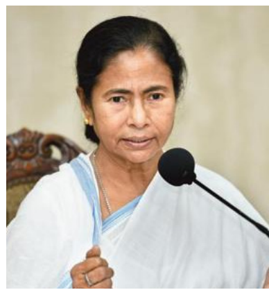
— Darjeeling, Kalimpong and Kurseong in North Bengal Hills